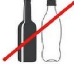
GLASS OR PLASTIC BOTTLES