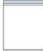
ONE GALLON CLEAR PLASTIC FREEZER BAG