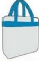
CLEAR PLASTIC BAG No larger than 12" x 6" x 12"