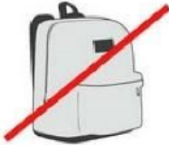
BACKPACKS OF ANY SIZE

The following items are NOT allowed at McKenzie Stadium