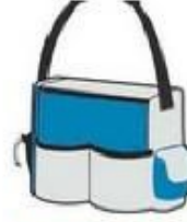
DIAPER BAGS (with Baby or Child) No larger than 6" x 12"