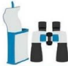
BINOCULAR CASES (with binoculars)